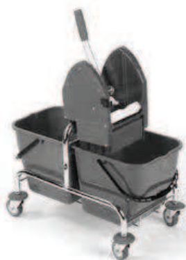
Double bucket cart