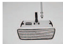
Single mop (microfiber)