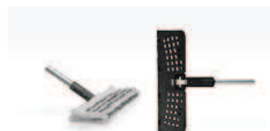
Double mop (microfiber)